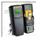
MicroDock II compatible