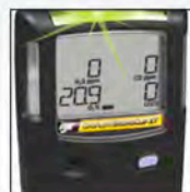
Black housing available