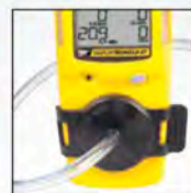
Simple calibration and bump testing