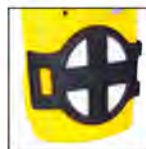
Auxiliary filter kit