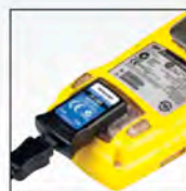
Easily download datalogged info