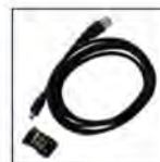
IR connectivity kit