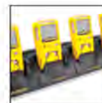
Five unit cradle charger

For a complete list of accessories, please contact BW Technologies by Honeywell.